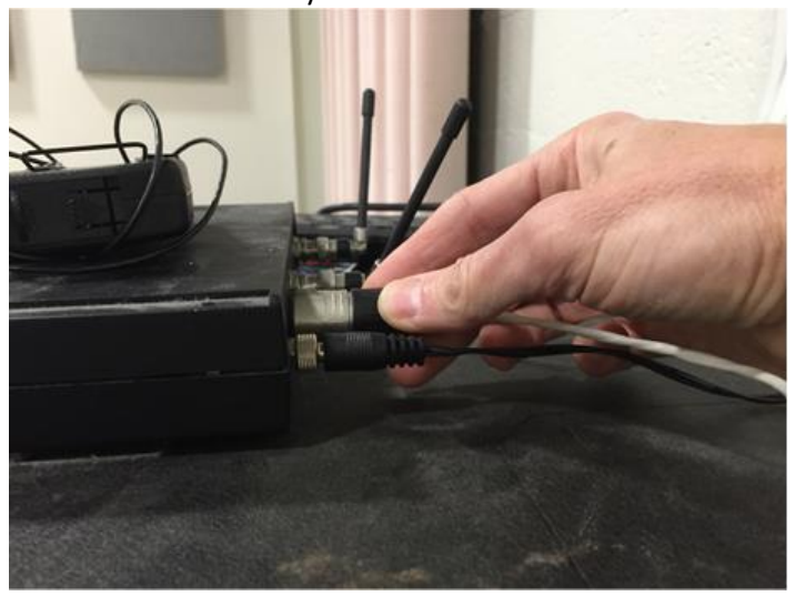
Then use that connection to feed into their microphone.

Or, if they have a XLR connector on their microphone they can plug in to the system's sound by unplugging the cable at the rear of the Shure system.